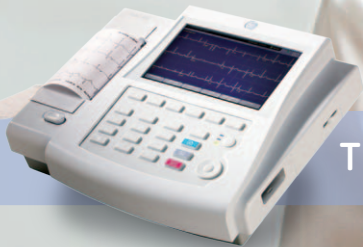
The new MAC* 800